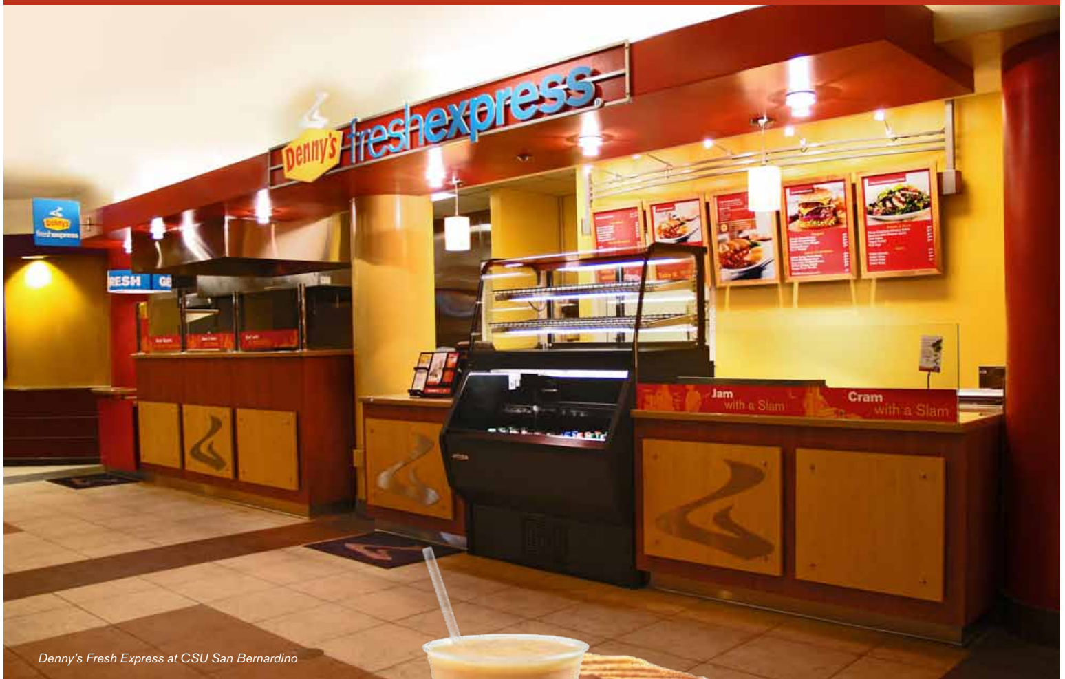
Denny's Fresh Express at CSU San Bernardino